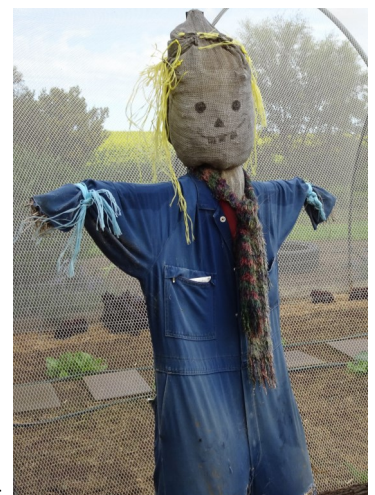
The scarecrow protecting Heather's covered vegetable garden.

Thank you to our members who helped make this a successful visit with our neighbours.